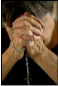
Many Hispanic Americans believe that stress plays a factor in the development of dementia.